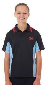
Short Sleeve Navy Polo Top