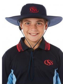
Navy Slouch Hat