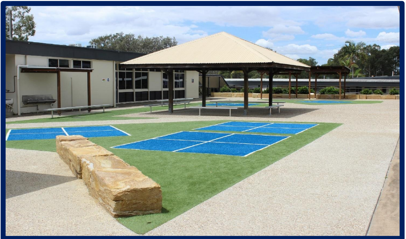
1 / 2 Outdoor Learning Area