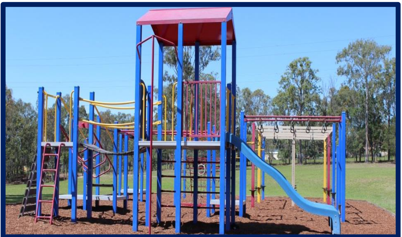
3 / 4 Adventure Playground