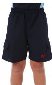
Navy Cargo Shorts