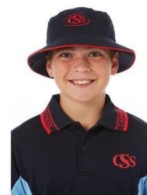
Navy Bucket Hat