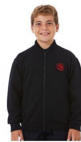
Navy Fleece Jacket