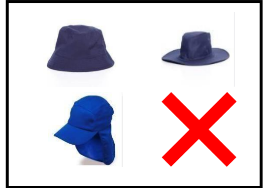
Bucket Hat w/Logo