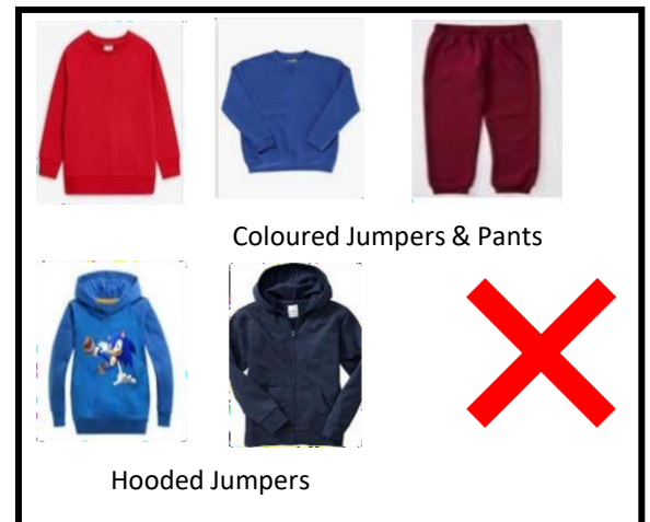
Coloured Jumpers & Pants